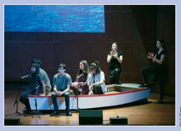
2020 Sahba Aminika's Stormy Seas told the stories of young boat refugees who braved perilous journeys in search of safe shores.