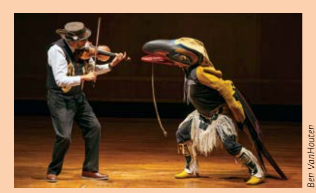
World Premiere: Raven and the Box of Daylight

Help MOR build a permanent legacy ensuring that the music and the message endure after the last note is played.