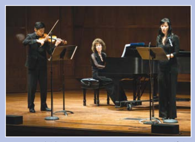
2017 Ryuichi Sakamoto's Snow Falls was a soulful reminder of the horrors of nuclear war.