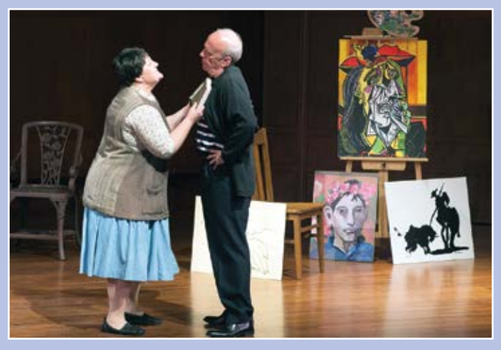
2015 Tom Cipullo's award-winning opera After Life imagined a passionate debate between the ghosts of Pablo Picasso and Gertrude Stein over the role of artists and the meaning of art in a troubled world.